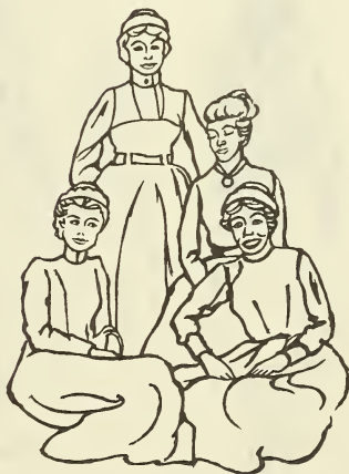
SPANISH AMERICAN WAR 1898-1899